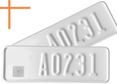
(Embossed 1-Layer Plate)